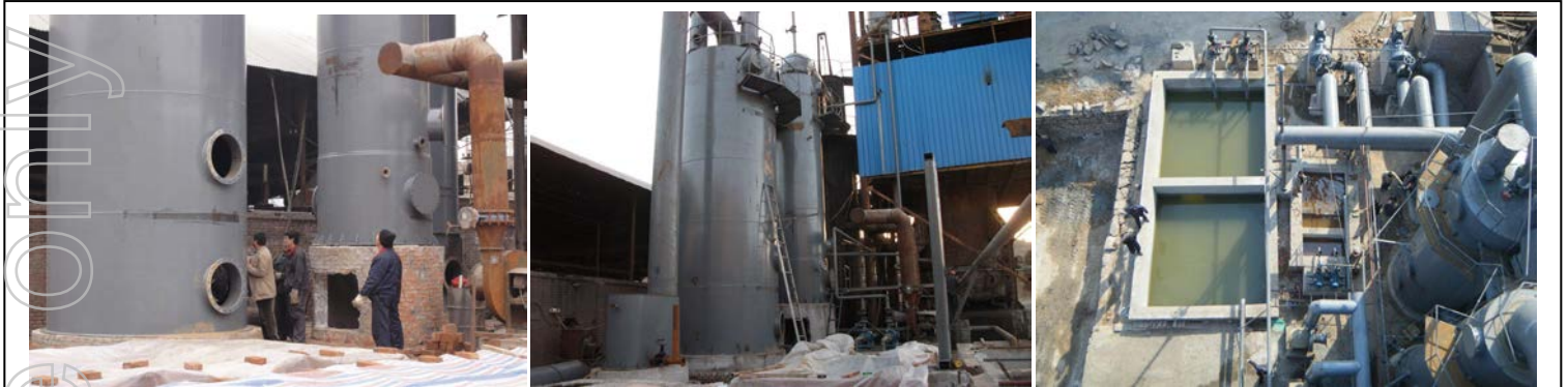
Construction of the Coal to Gas Plant

“Commissioning of the original plant within five months of listing is a tribute to the efforts of our staff in Pingyao, and the support of our suppliers and partners in Shanxi Province. At this time we expect the upgrade and first stage expansion to be completed either on time or ahead of schedule.”