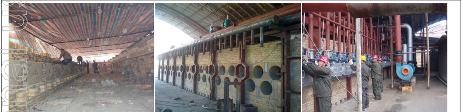
Development and Completion of the new ovens at the existing Plant

For further information, please contact: