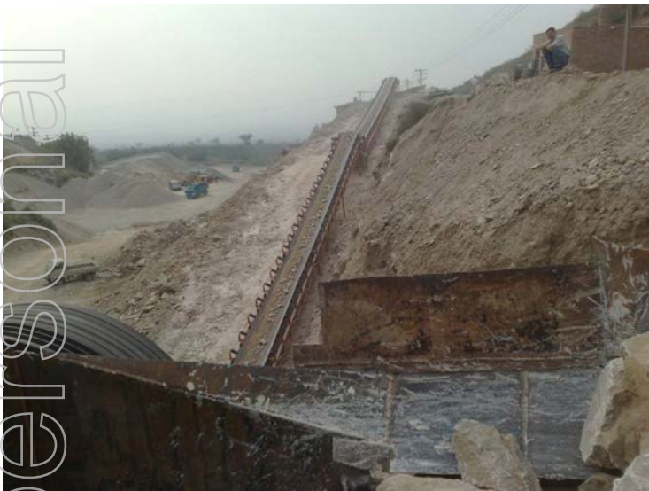
Conveyor belts and production at the Quarry